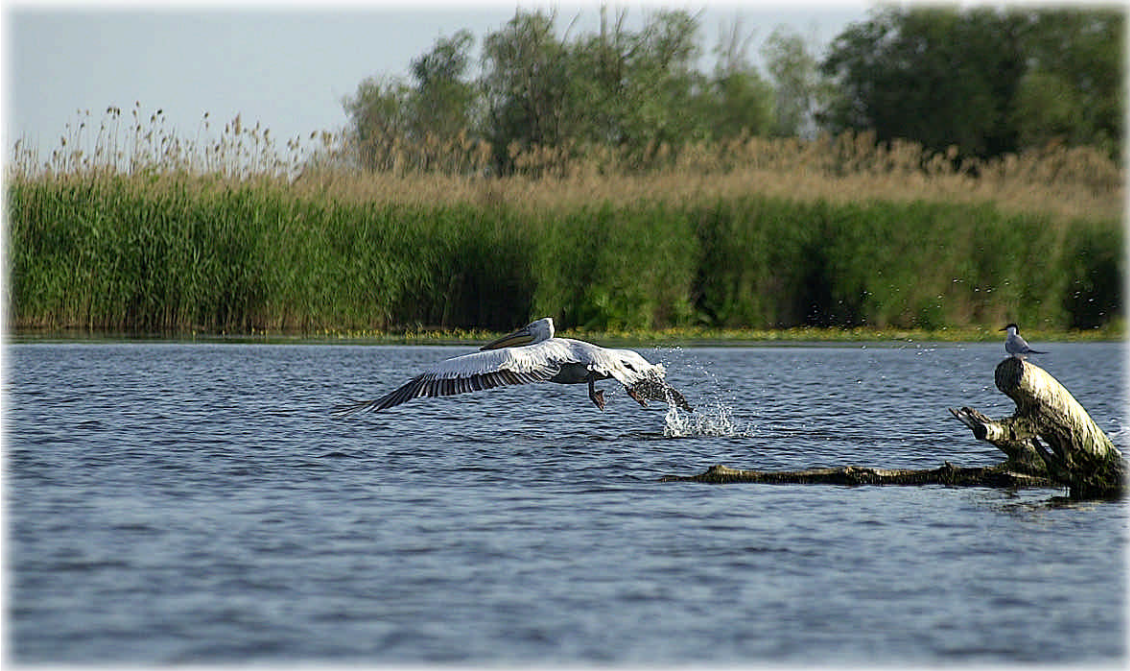
A pelican takes off from a lake near Mila 23